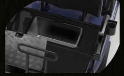
Plastic rear seat kit with storage & cup/cell phone holders