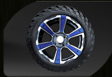
14" Color Matched Silent Tire with Offroad Thread