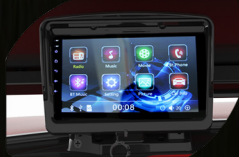
9 inch touchscreen with back-up camera